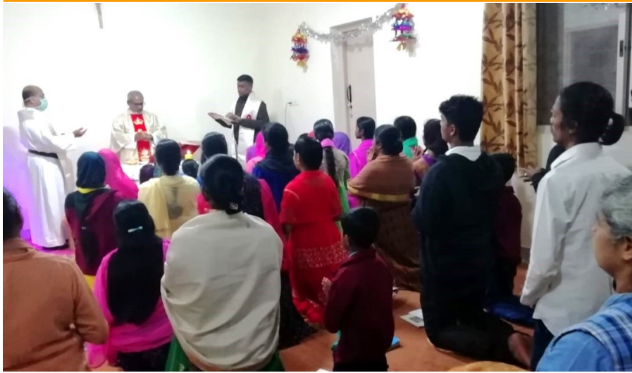
Christmas celebration at Jyothir Bhavan community with FSM sisters and Philosophy students. (left and below)