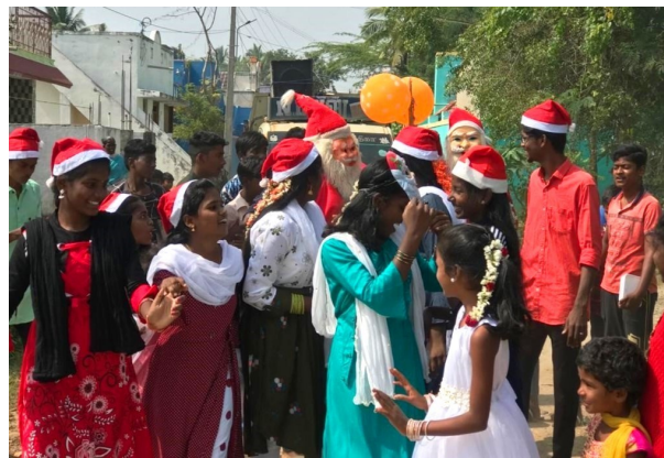
Christmas carols in Randham initiated by the elders. (left)