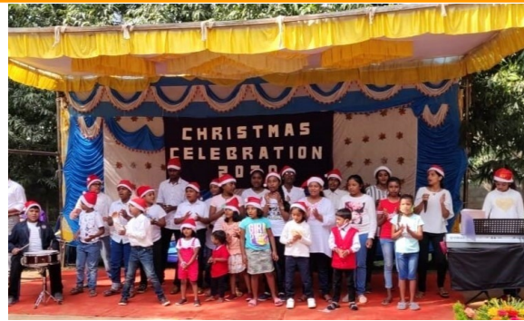
Christmas celebration at Jeevadhama along with the Rosary family and neighbors. (left)