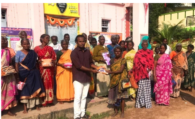
Christmas gifts given in Randham with the help of donors; cloths to the widows, and elders (left) Free cow feed distributed to 80 families of the Milk society( right)