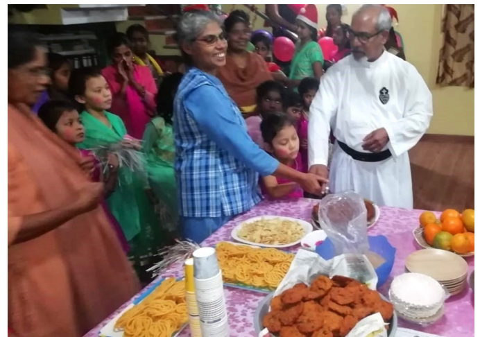
Christmas celebration at St. Gemma Novitiate, Nilambur. (below)